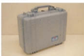
Carrying trunk case

Specifications and appearances are subject to change without notice.